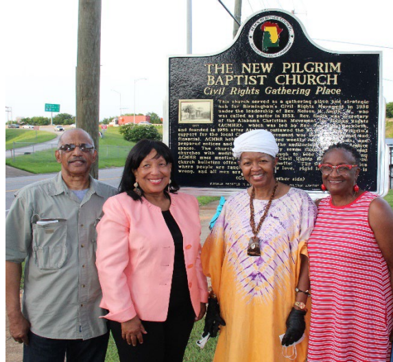
Marker with Photograph (Large 30”h x 42”w)