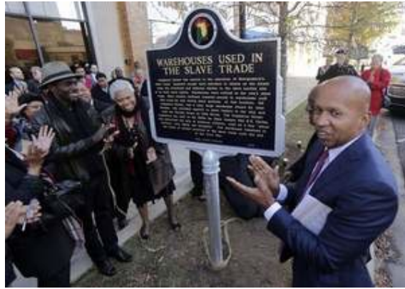
BHC Marker (Large 30”h x 42”w)