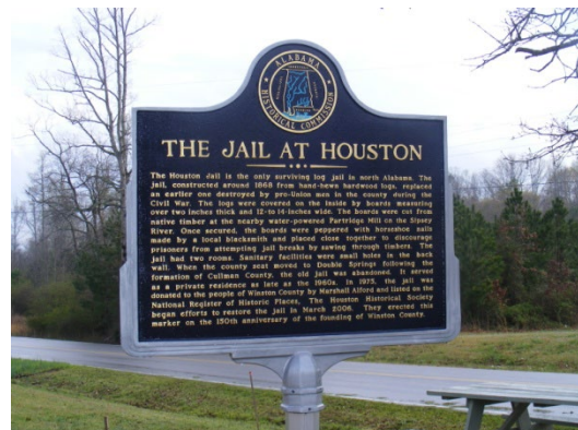
AHC Historical Marker (Large 30”h x 42”w)