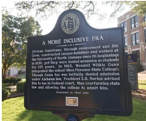
Marker with QR Code